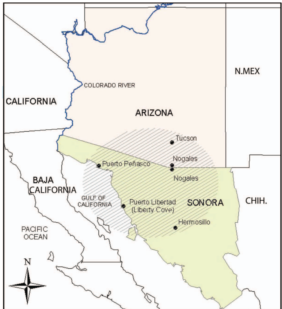
Figure 2. Arizona–Sonora region of the U.S.–Mexico border. Credit: Rolando Diaz Caravantes.

due to the economic promise the $35 million plant has for U.S. consultants and contractors. States in the Southwestern United States are interested in more than feasibility studies, however; they favor transboundary arrangements offering access to the desalinated water. Arizona and Sonora have partnered to commission a study of a binational desalination plant, also in Puerto Peñasco, as a part of both states' future water augmentation strategies (HDR 2009). Nevada water augmentation plans speak of a similar strategy (Southern Nevada Water Authority 2009). The plans variously offer to pay for desalination plants in Mexico in exchange for shares of Mexico's Colorado River allocations or to convey water to points of use in Sonora and across the border in the United States (Glennon and Pearce 2007; Kohlhoff and Roberts 2007).